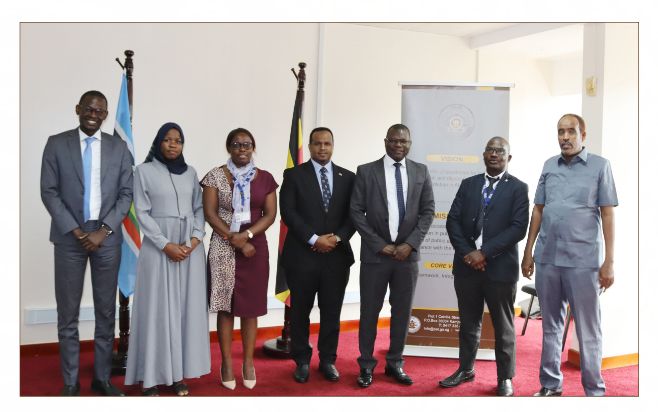
Figure 7: Meeting of the PPDA Appeals Tribunal Secretariat with a delegation of the Somaliland National Tender Board on May 11, 2022.