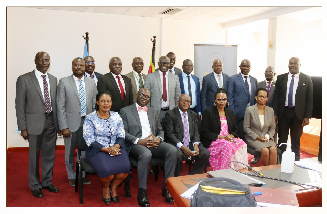
Figure 6: Inaugural meeting of the PPDA Appeals Tribunal with the Board of the Public Procurement and Disposal of Public Assets Authority at the Tribunal Offices.