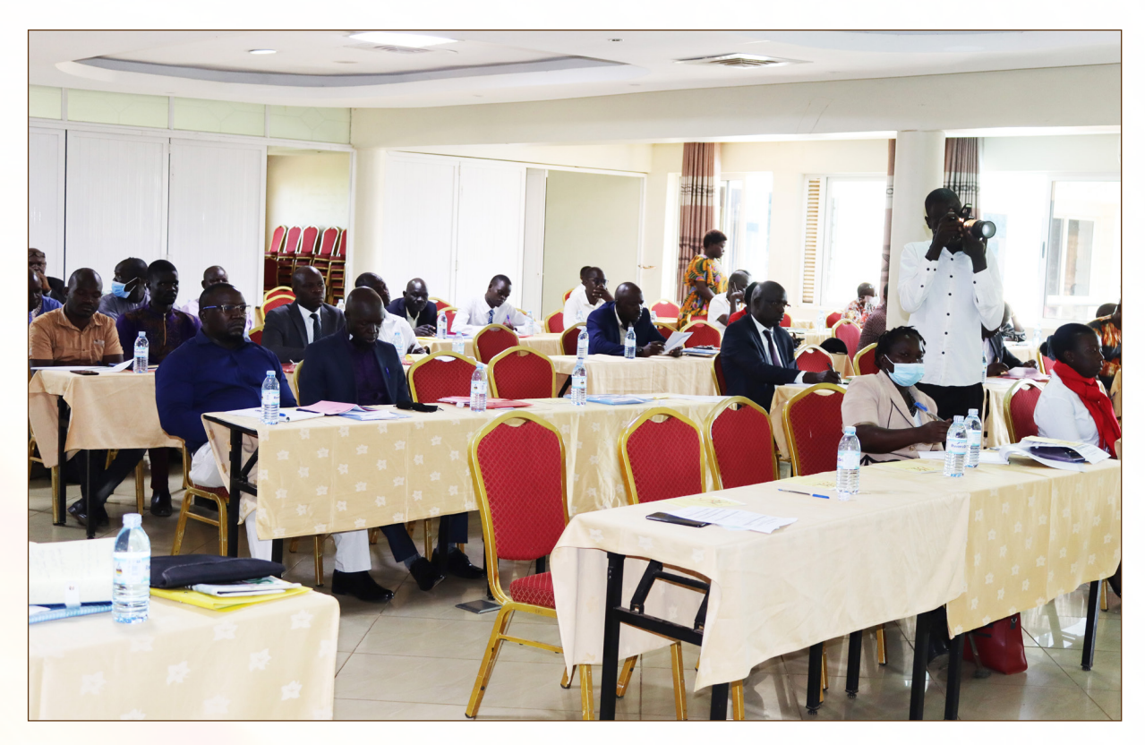
Figure 4: Participants at the workshop for Acholi Sub Region, organised by the PPDA Appeals Tribunal at Bomah Hotel Ltd on May 19, 2022.